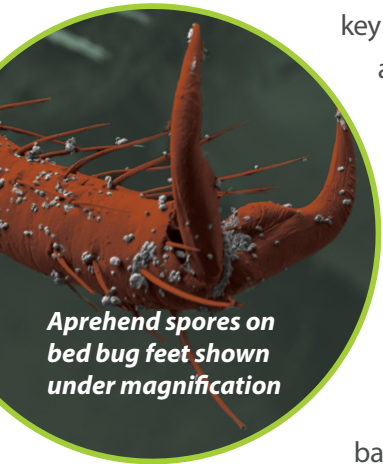
Aprehend spores on bed bug feet shown under magnification

Strategic barriers are applied in key areas where bed bugs are known to harbor after introduction. When bugs cross the barrier, they pick up Aprehend spores and go on to die of the fungal disease in 3 - 7 days. This prevents the establishment of a bed bug infestation, and the barriers continue to provide protection for up to 3 months.